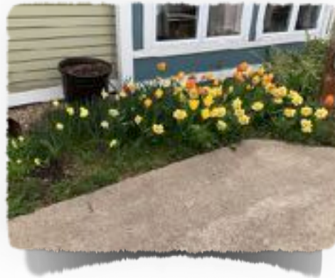
Our gardens were looking beautiful this spring