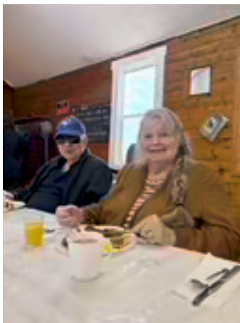
We went out for breakfast in Queenstown on May 16.